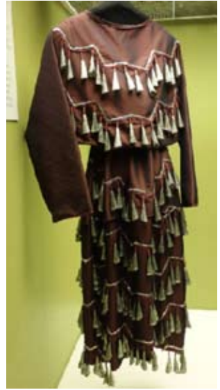
Traditional Ojibwe Jingle Dress in the Wisconsin Historical Museum.

An Ojibwe Story travels with traditional dancers, but also invites local dancers to join the production at each of its performances. While today's audiences are more familiar with stories told through ballet, tap or jazz dancing, Ojibwe traditional dance is a rich source of storytelling. One example is the Jingle Dress dance. Originating during the influenza pandemic of 1918, the dance tells the story of a sick girl healed by dancing in a dress covered in silver cones. One tradition says that the girl's grandfather, an Ojibwe medicine man, dreamed of the dance, dress and music before teaching his granddaughter the dance.