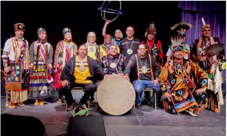
Anishinaabe Dibaajimowin: An Ojibwe Story cast. (Orchestra not included)